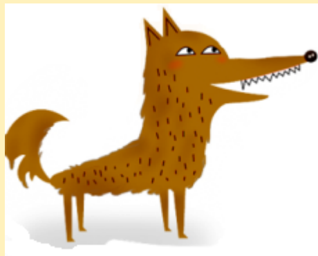
Mefitu wolf (media driver)